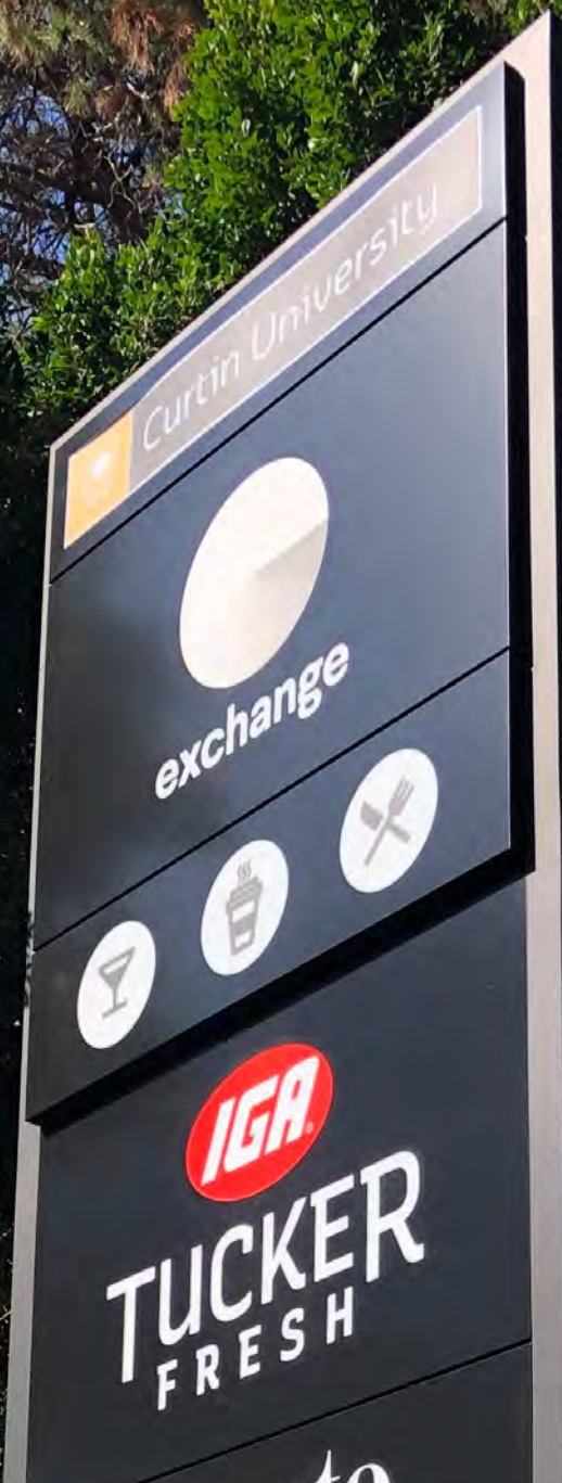
Curtin Exchange Pylon & Directional Signage