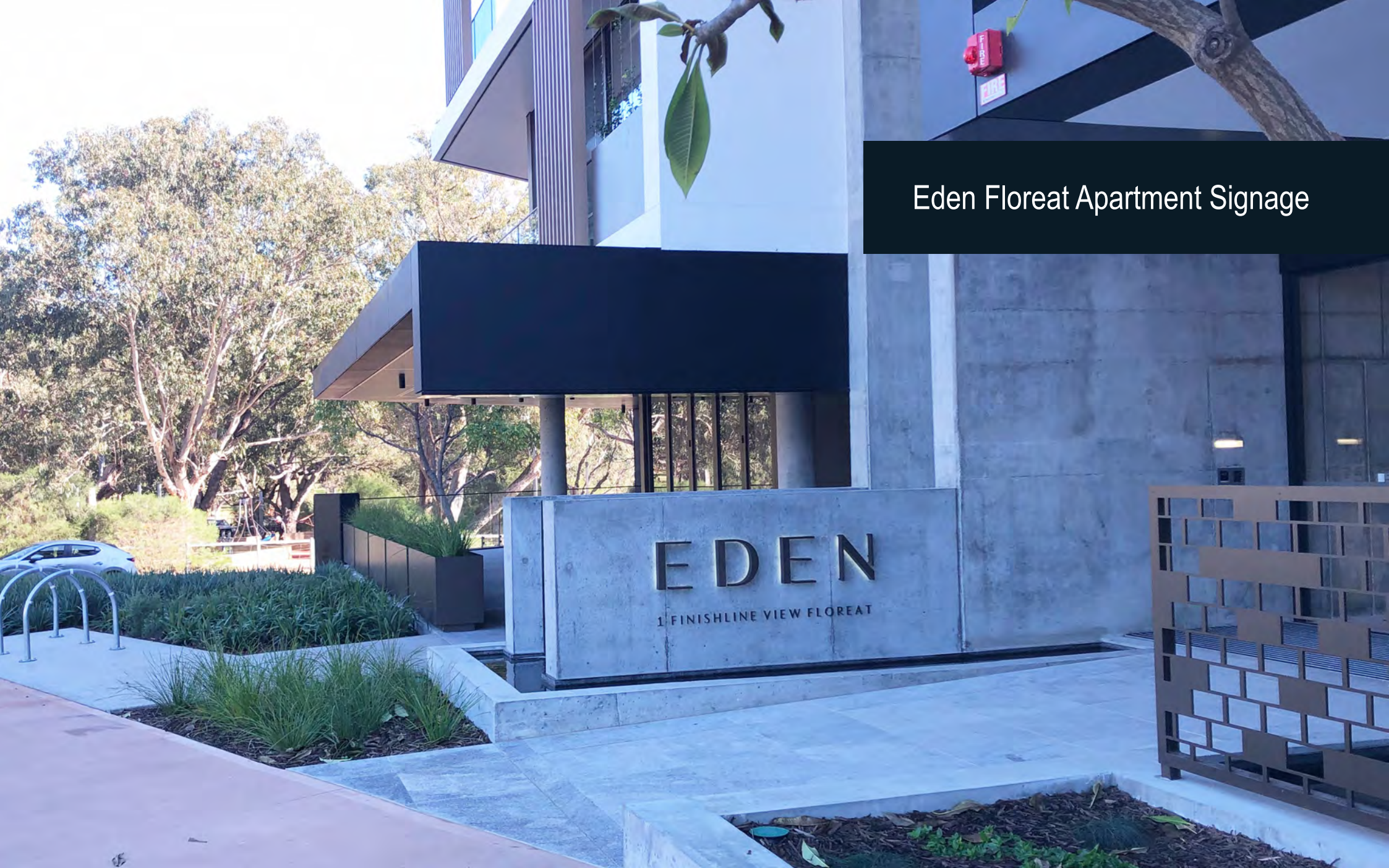
Eden Floreat Apartment Signage