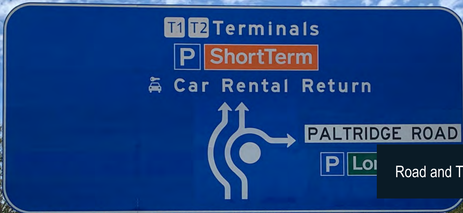
Road and Traffic Signs